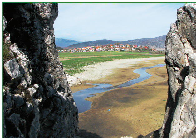
Fig. 4. Zaver Swallow hole; water level elevation at about 844.5 m asl (2005)

mostly was supplied by Devoll River belonging to another watershed.