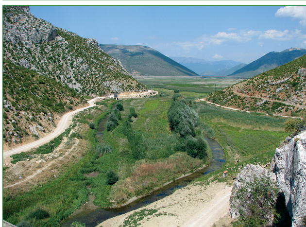
Fig. 5. The littoral zone of Lake Small Prespa in Albanian territory is transformed into a wetland by the sedimentation of the small-size sediments of Devoll river diverted into the lake

karst springs along the Ohrid lakeside. The configuration of Zaver swallow hole at high water level is like a prolongation of the lake about 600 m in length finishing in a natural vertical Upper Triassic limestone wall about 25 m high of Mali Thate Mountain (Fig. 6). At the foot of the limestone wall is located Zaver swallow hole and a big cave not yet well investigated is developed close to it. In the memory of the local people is transmitted the description of a “road” connecting two sides of the Lake prolongation finishing to Zaver swallow hole but no one has seen it until the years 2002–2005. At this time interval the Lake arrived the lowest known level of about 844.5 m asl and the road emerged with all its mystery. The road is about 200 m long; it is constructed like a dam which the carriage way in average about 2.5 to 3.0 m wide, while its height varies from about 0.5 m in both extremes of the road to about 3 m in the central, deepest part of the water flowing to Zaver swallow hole. The road is constructed