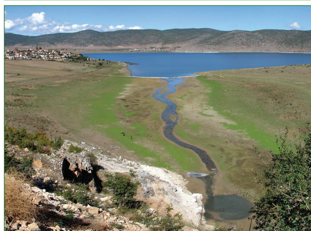
Fig. 6. During 2005 was possible to see the presence of a road (or dam) connecting two sides of the Prespa Lake prolongation finishing in Zaver swallow hole