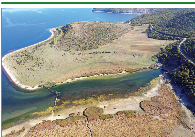
Fig. 2. Zaver swallow hole; photo of 12 September 2019

Jovan Cvijić (3) in 1905 described in detail the karst phenomenon of the Prespa and Ohrid lakes area and formulated the hypothesis that Prespa Lake recharges St Naum and Tushemisht springs issuing in Ohrid lakeside. Some investigations conducted with environmental isotope techniques supported by IAEA – Vienna have demonstrated that Tushemisht Spring at about 52-54%, and St. Naum Spring at about 42–46 % are recharged by Prespa Lake (4, 5, 6, 7, 8). However, the most significant and curious karst phenomenon of the area is Zaver swallow hole, which is located in Prespa lakeside between Small Gorica and Gollomboch villages (in Albanian territory). There an intensive loss of the lake water into the karst basin could be seen ( Fig. 2 ). Taking into consideration the difference of water levels in both lakes of 155 m in average and the distance of 17 km between the two lakes in the direction Zaver swallow hole - Tushemisht and St. Naum, the maximum hydraulic gradient of karst water flow is 0.0091.