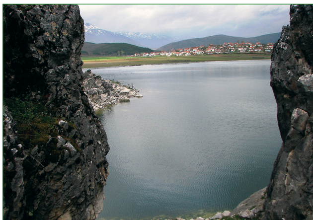
Fig. 3. Zaver Swallow hole; water level elevation at about 847 m asl (2012)